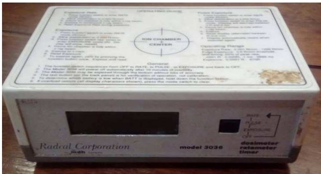
Figure 2. RADCAL model 3036 dosimeter.

The Model 3036 RADCAL Dosimeter is a device used to measure the exposure (in R), the exposure rate (in R / min)