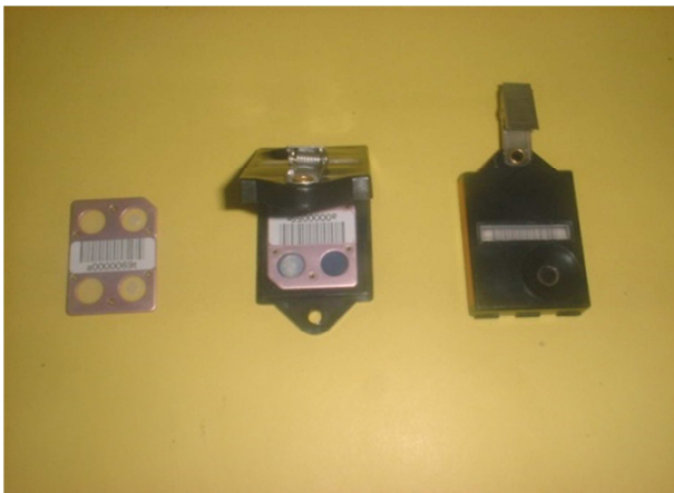
Figure 1. Thermoluminescent dosimeters.

This dosimeter contains Thermoluminescent detectors as sensitive elements. These detectors have the property of accumulating a portion of the energy from the incident radiation in metastable energy situations of Thermoluminescents material. As a result of heating, part of this energy is released in the form of visible light. The measurement of the amount of light makes it possible to calculate the dose of radiation incurred. The minimum detectable dose is around 100 μSv. After reading, the detectors can be reused; as a result, they are relatively cheap for a long period of time.