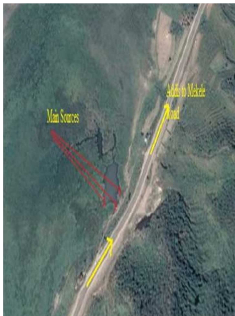
Figure 2. Location of Kemessie hot spring.

It is found near to Kemissie town at a place known as Chefa wet land. This hot spring can be found at 10^{\circ}38'06.57''\text{N} , 39^{\circ}55'21.95''\text{E} at elevation of 4656 ft from sea level. Figure 2 depicts satellite picture of Kemessie hot spring.